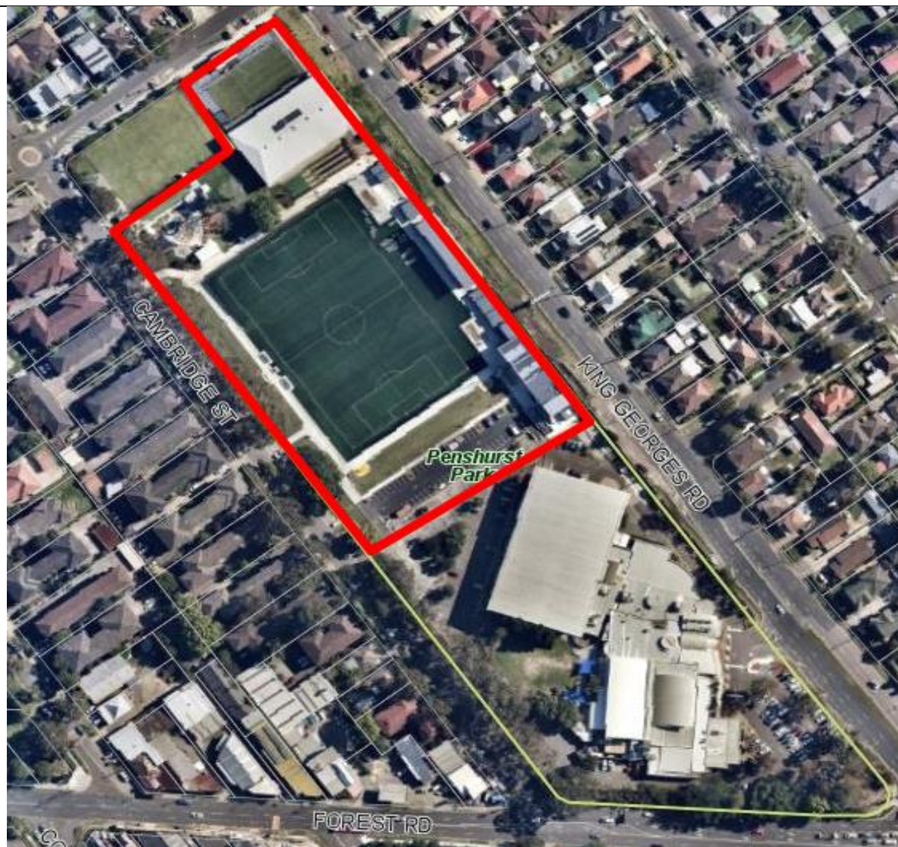
Specific location of the works the subject of this application