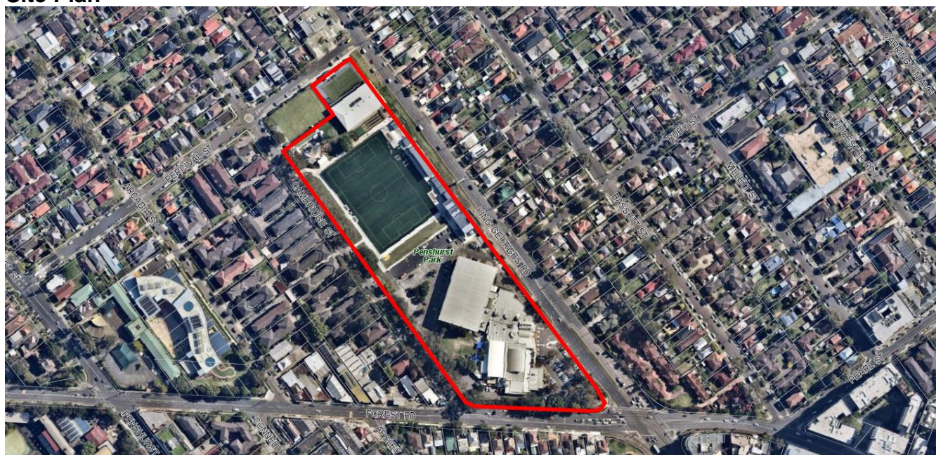
Aerial photograph of the subject site outlined in red and immediate surrounding area.